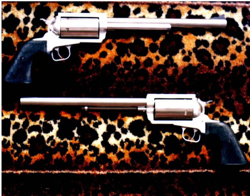
Top: .450 Marlin BFR, Bottom: .500 S&W BFR