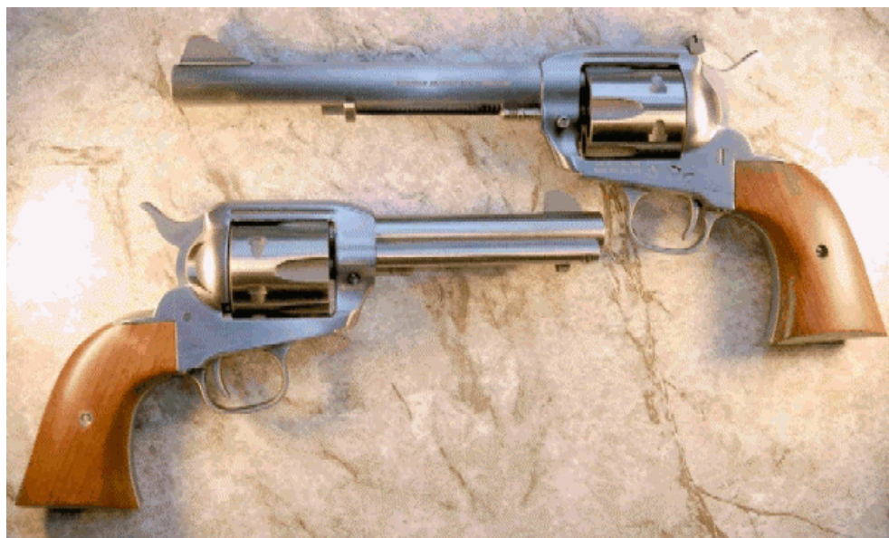
Virginian Dragoons - .44 Magnum, Sic Semper version (top), .357 Magnum Deputy Model, Liberty Forever Version (bottom)