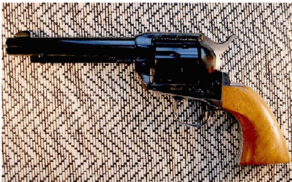
Hammerli Virginian in .357 Magnum